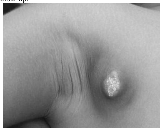
Figure 3: Suppurative BCG lymphadenitis in right axillary region. The lymph node measures 5 cm in diameter, and is fluctuant in centre and the overlying skin is inflamed

(n=4), staphylococcus epidermatitis (n=3), pseudomonas (n=1) and Klebsiella spp. (n=1). Post operatively all the patients were prescribed antituberculous treatment for 6 weeks. Nine patients though advised did not take anti-tuberculosis drugs in postoperative period for various reasons. Two patients had superficial wound infections, and three developed seroma. All patients recovered and did not showed evidence of lymphadenitis or systemic tuberculosis on 6-18 months follow-up.