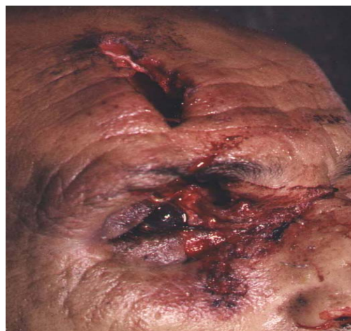
Figure 1. Typical stellate shaped entry wound showing tattooing effect

Examination of the victims of firearm injuries need to ascertain the characteristics of entry wound such as muzzle imprint, burning (flame effect), smudging (the smoke effect), tattooing or stippling and the collar of abrasion (only in rifled weapons). The exit wound will not show these characteristics, except the everted margins of different sizes.