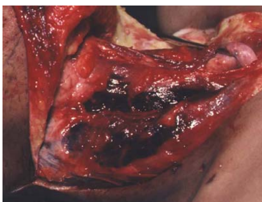
Figure- 3 Multiple entry wounds dissected at autopsy