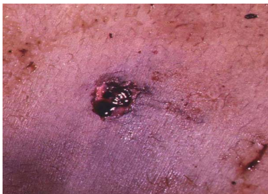
Figure 2. An entry wound with visible shining projectile