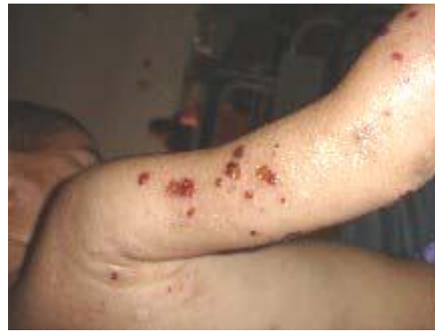
Figure-5: Vesicles and blisters on body