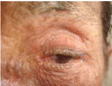
Figure-2: Beaded appearance of both eyelid margins