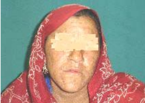
Figure-1: Acneiform lesions and scars on face.

The typical clinical features are presented in the photographs below.