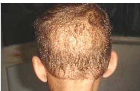
Figure-4: Sparse and thin hair on scalp