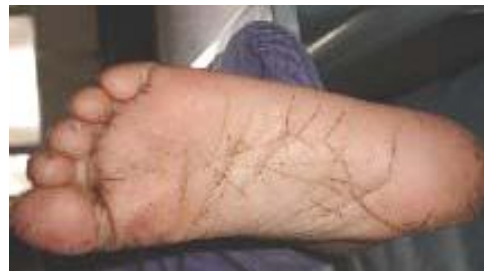
Figure-7: Deep creases on soles of feet