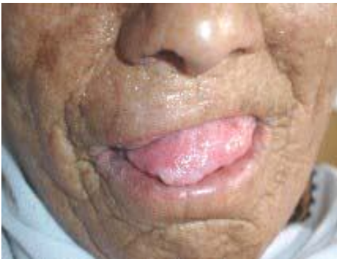
Figure-3: Limitation of tongue protrusion