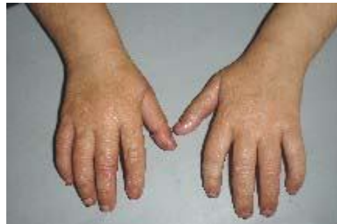
Figure-6: Claw like hands