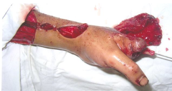
Figure-2: Fourth metacarpal bone utilized to lengthen the stump of index finger with reverse radial artery flap ready to cover the whole of the wound as well as bone graft