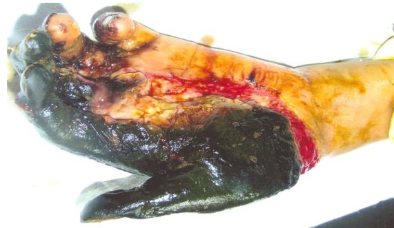
Figure-4: A fifteen year old patient with sugarcane crusher injury of left hand.