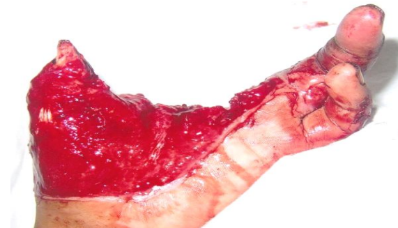
Figure-5: Same patient after debridement of the wound