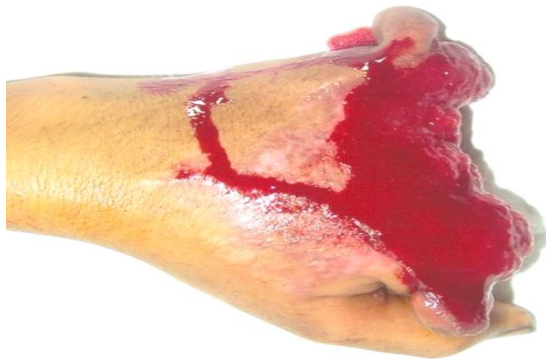
Figure-1: Injury at transmetacarpal joint level caused by minced meat machine.