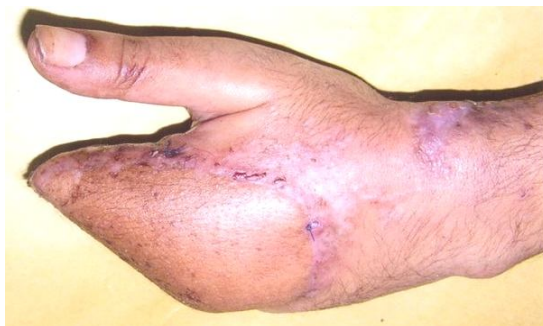
Figure-3: Same hand on fifteenth post operative day