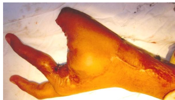
Figure-7: Same hand after the z plasty