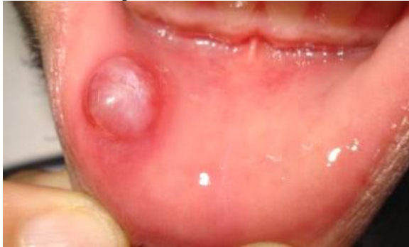
Figure – 1: Swelling on right lower lip

A 48-year-old Indian woman presented with a painless lower right lip swelling of size 1×1 cm for two years (Figure-1). The swelling was initially small and slowly increased its size. The overlying mucosa was normal. The swelling was superficial, bluish, fluctuant, soft and non-tender with diffuse margins. She could not recall an episode of trauma to the maxillofacial region. A biopsy was performed and showed areas of spilled mucin surrounded by a granulation tissue with infiltration of chronic inflammatory cells and foamy histiocytes. Dilated salivary gland ducts were also seen in the section (Figure-2). No recurrence was observed at 5 months follow-up examinations.